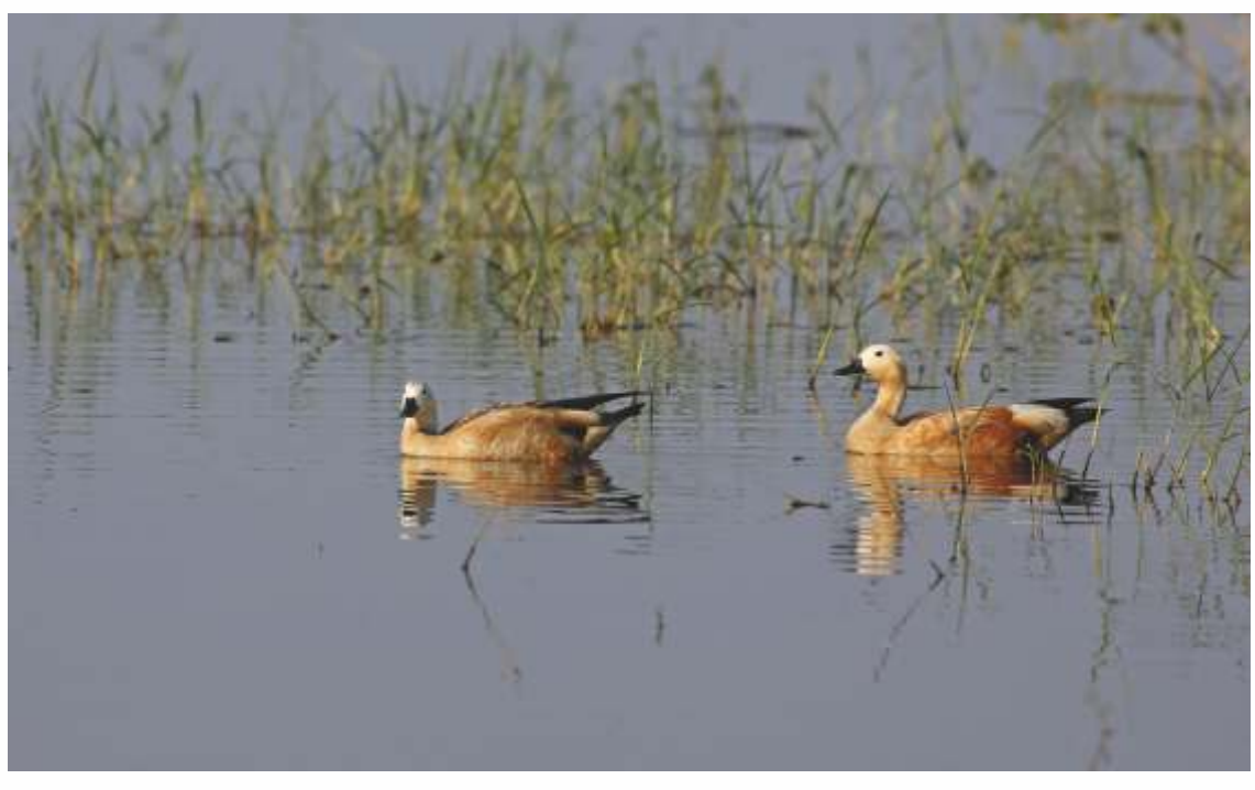
Ruddy Shelduck Tadorna ferruginea

The occupant feathered creatures incorporate Black Ibis, Spot Bills, Teals, Little Grebe, Cormorants, Egrets, Herons, Stork, Kites, Vultures, Buzzards, Harriers, Osprey, Quails, Partridges, Eagles, Water Hens, Sand Pipe, Swifts, Grey Hornbill, Peafowl, and so on. Despite the fact that this haven is mainly a bird sanctuary, numerous other intriguing types of untamed life can likewise be spotted here. The creatures spotted here are Otter, Palm Civet, Fishing Cat, Jackal, Mongoose, Wolves and numerous types of Snakes, and so forth. About 24 types of fishes also have been recorded in the supply.