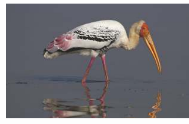
Painted Stork Mycteria leucocephala