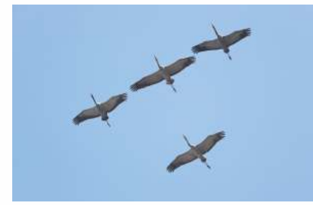
Demoiselle Crane Grus virgo