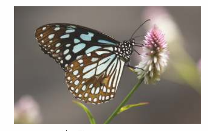
Blue Tiger Tirumala limniace