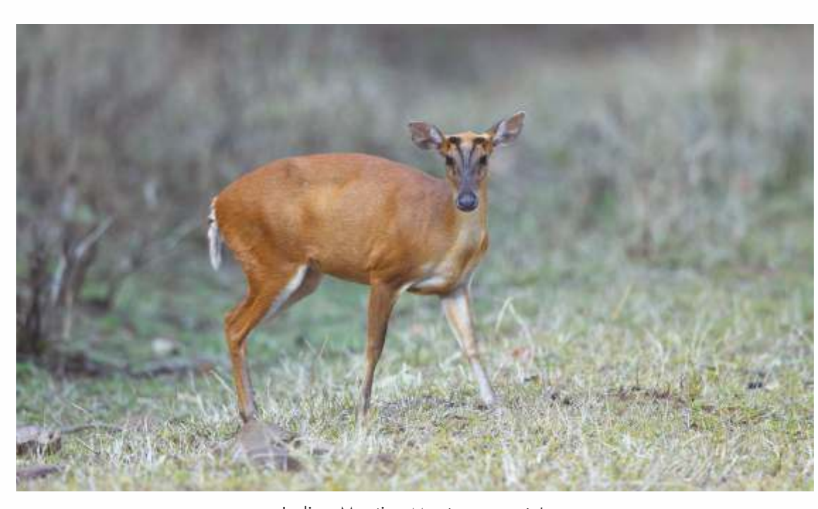
Indian Muntjac Muntiacus muntjak

Barking Deer, Chinkara, Hare, Porcupine, Jungle Cat are common animals found in the sanctuary. Migrant animals include Hyena, Jackal, Wolf and Wild Boar. Monitor Lizard is the common reptile in this sanctuary. Migratory birds do visit the area. Notable among them are Brahmini Duck, Crane, Stork and many waders. Common resident birds are Peafowl, Quail, Partridge, Egret, Heron, Cormorant, Coot, Spotbill, Eagle and Owls etc.