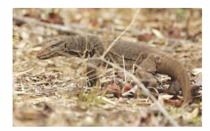
Bengal Monitor Lizard Varanus bengalensis